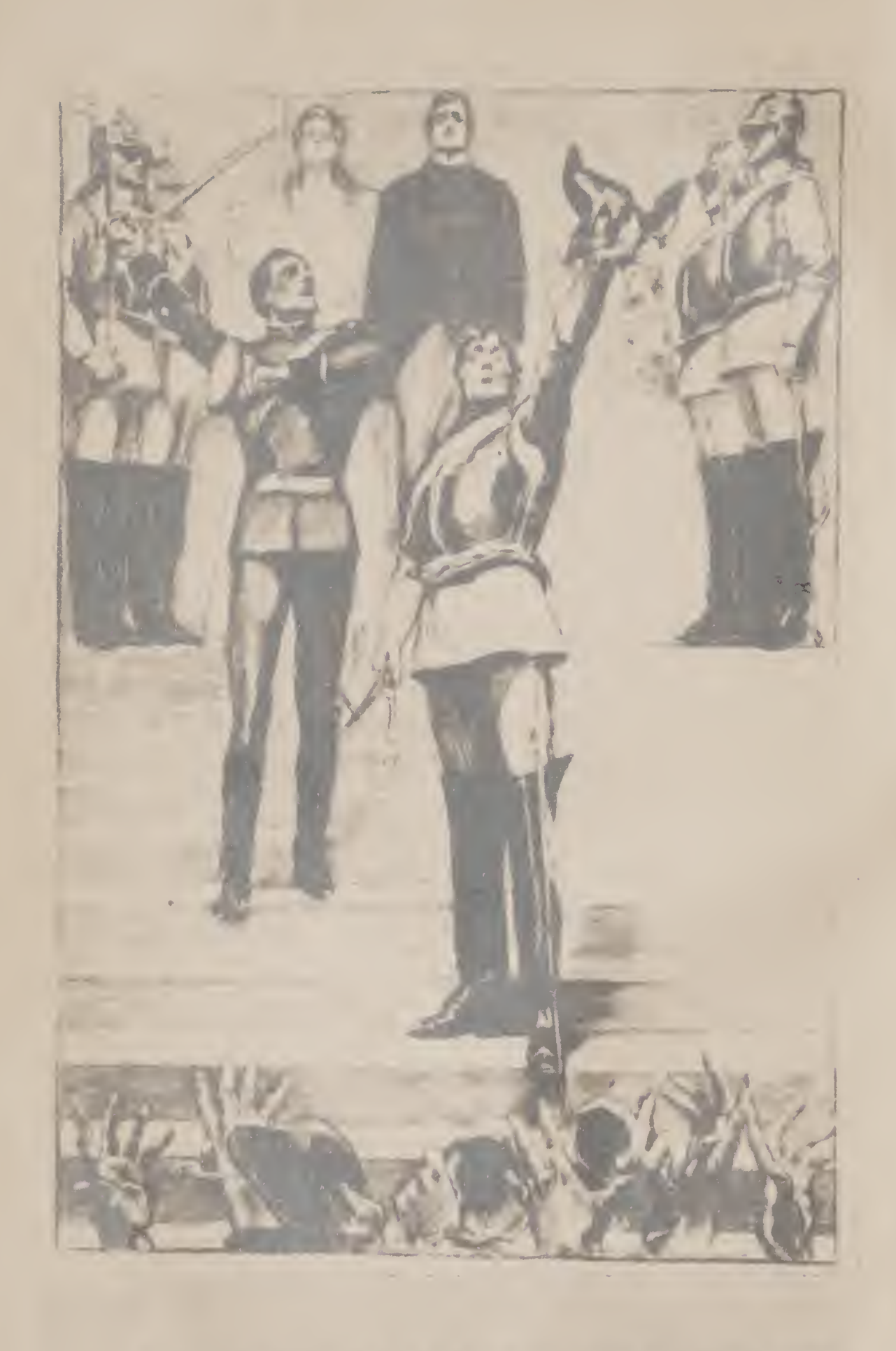
Formen tein weard his helmet, crying "God save the king!"